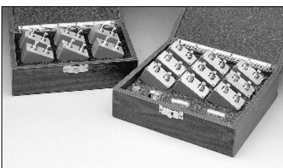
Model 5906: Calibration sources for Models 590/1M, 590/100k, 590/100k/1M, and 5904. Includes 1.5pF, 18pF, 180pF, 1.8nF, 18nF, 0.5pF, 4.7pF, 470pF, 4.7nF capacitance sources and 1.8µS, 18µS, 180µS, 1.8mS, 18mS conductance sources. Includes two storage cases.