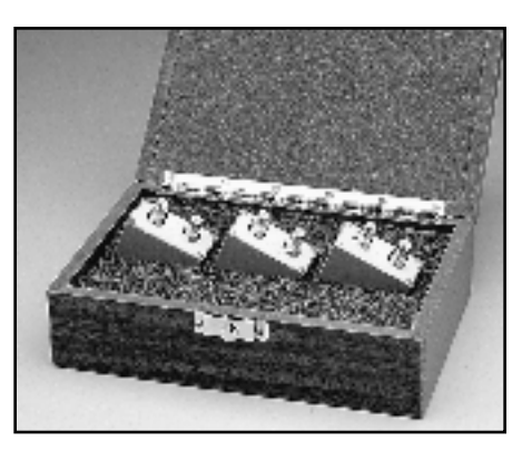
Model 5955: Calibration sources for Model 595. Includes 18nF, 1.8nF, 180pF capacitance sources and storage case.