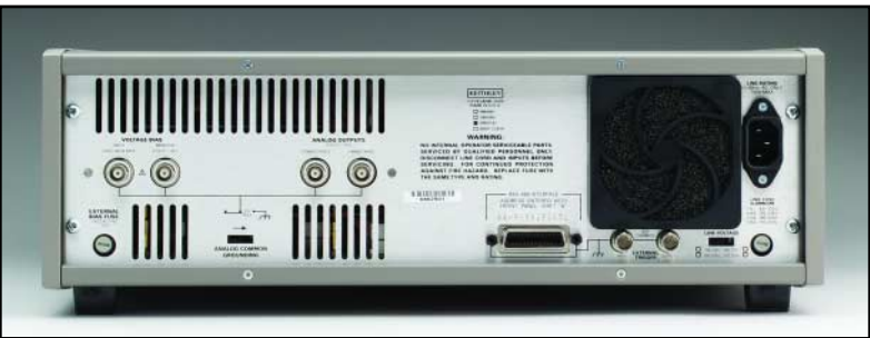
Model 590 rear panel